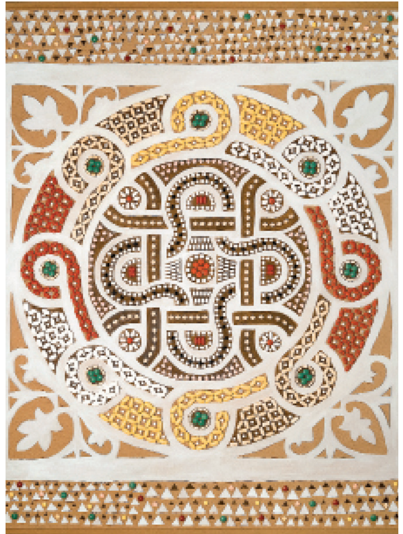
Peggy Kliafa. Omphalio . 2011. Byzantine mosaic by true pills and acrylic colors on MDF. 102x102cm.