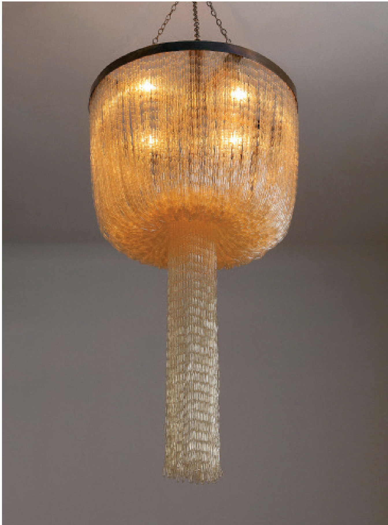
Peggy Kliafa. Chandelier I - Placebo Series . 2015. Sculpture. Chandelier made of transparent gelatin pills-capsules, fish line, bronze, light bulbs. 110 x 60 cm.